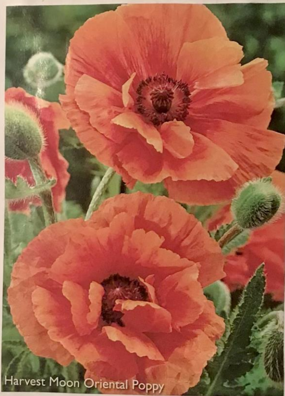
Harvest Moon Oriental Poppy

All proceeds to the Stephen Lewis Foundation Grandmother campaign, community-based support for African grandmothers caring for orphaned children due to the AIDS pandemic, now needed more than ever with recent world events.